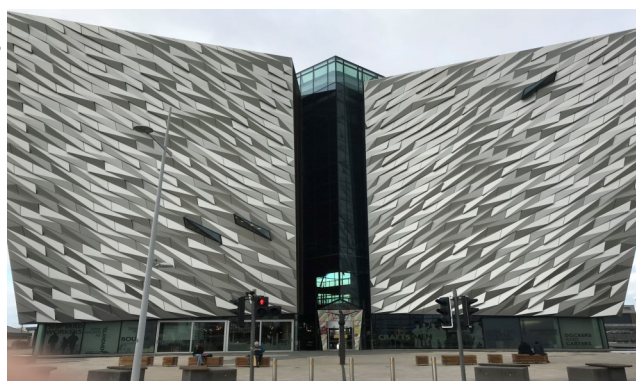
Above: The Titanic Belfast

4. Belfast, Northern Ireland: 1) The Titanic Belfast is a fantastic, interactive museum opened in 2012 to commemorate the 100th anniversary of the launch of the world’s largest